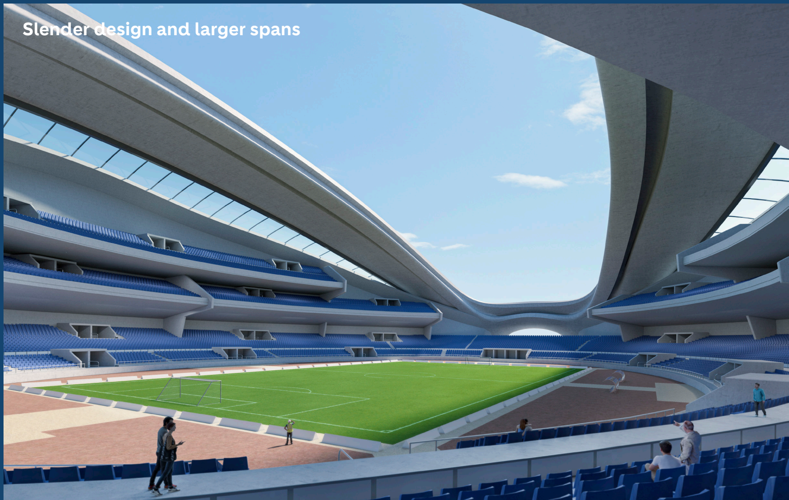
Slender design and larger spans